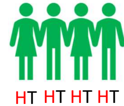
DAM as a Service